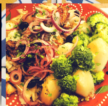
Bacalhau na chapa