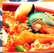
Arroz de Marisco