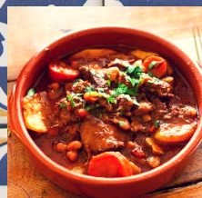
Guisado de Carneiro