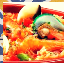
Arroz de Marisco