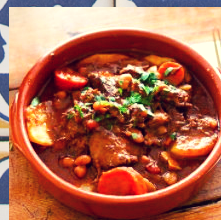
Guisado de Carneiro