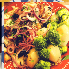
Bacalhau na chapa